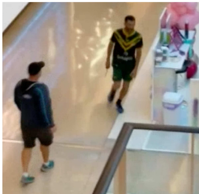
FIGURE 3 | The supportive stance.

These principles are designed primarily for use in educational, healthcare, and social service settings, where staff may encounter