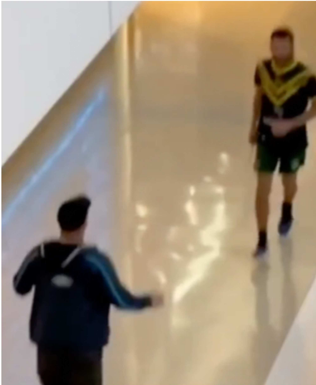
FIGURE 2 | Facing Cauchi with hands and arms visible and open.

plan. Furthermore, I did not feel alone but rather was being guided by a familiar force.